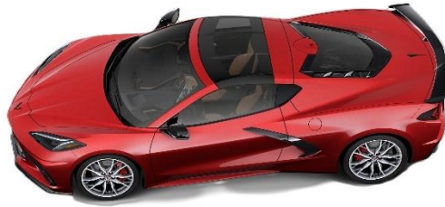
2025 Red Mist Corvette Coupe 2/13/2025 Price: $150.00 Drawing: February 13, 2025