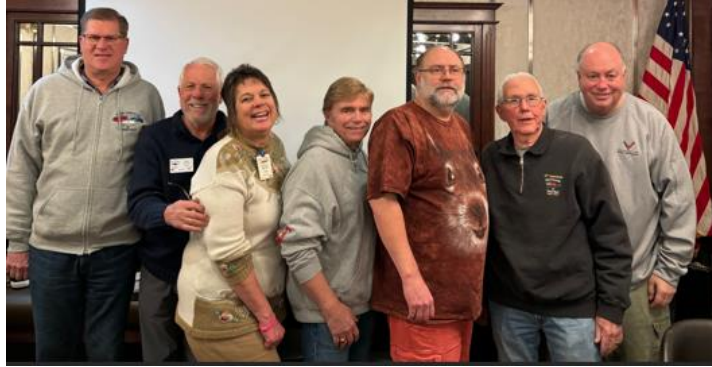
2025 E-Board Left to Right