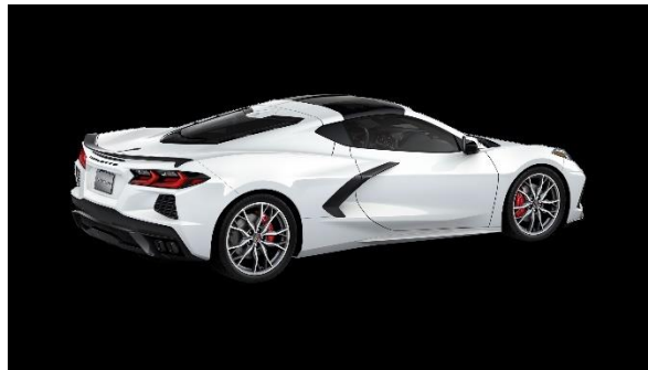
2025 Arctic White Corvette Coupe Price: $20.00 Drawing: April 26, 2025